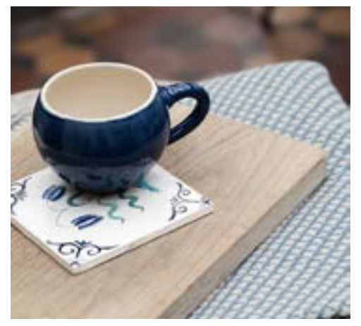
Twice a year the studio and Farmhouse showcases a selection of quality makers alongside our own textiles.

Both the Studio and the farmhouse are now also available for creative workshops. brechfafarm.pembrokeshire | e: gillianbrechfa47@gmail.com