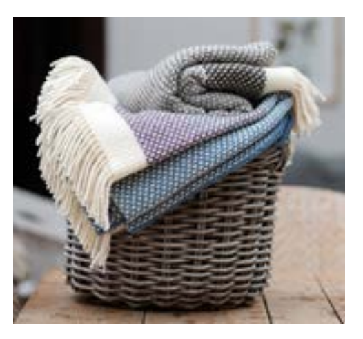
Limited edition throws and cushions made from Brechfa Pedigree Dorset and Coloured Dorset wool.